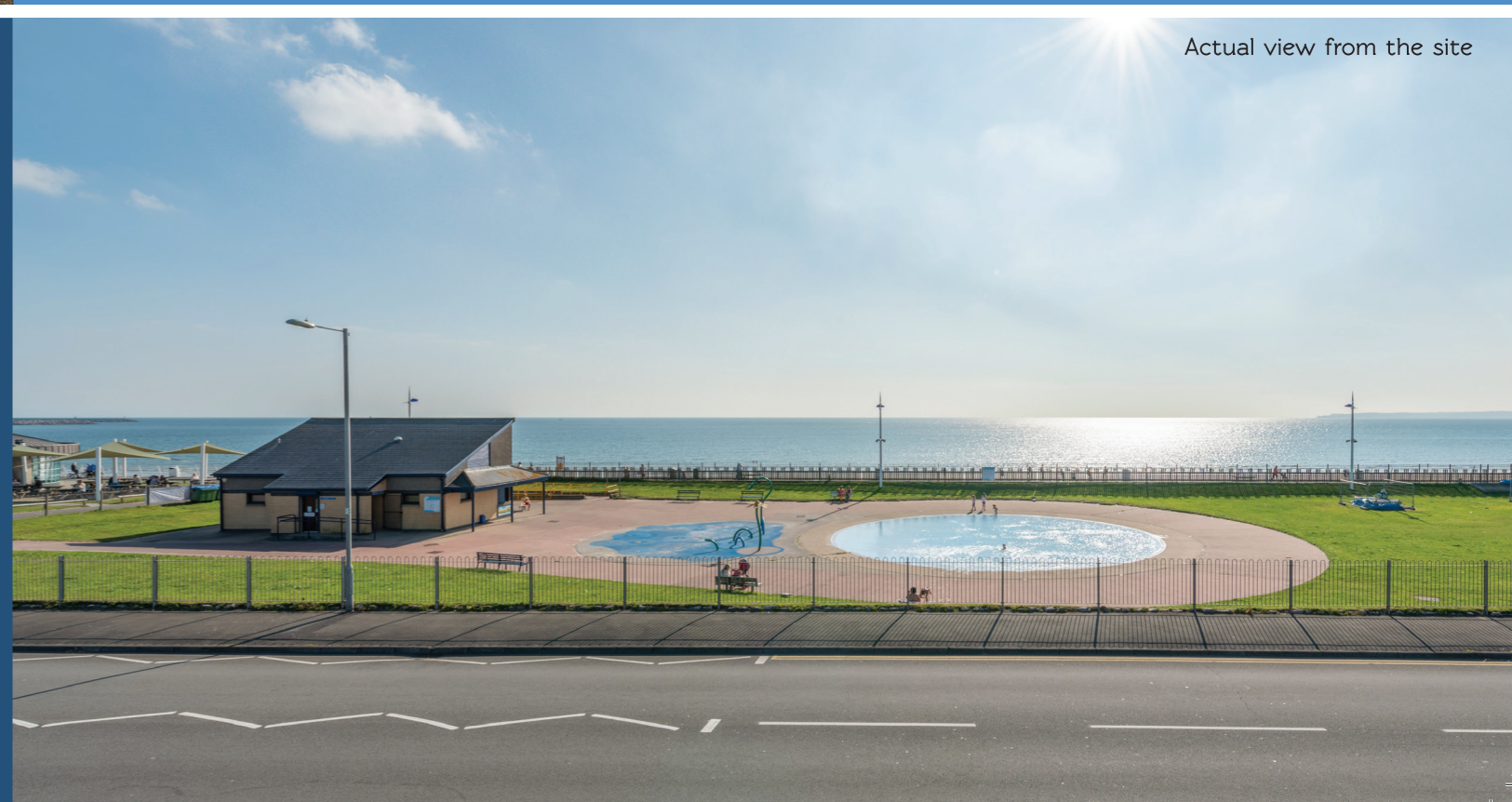
Actual view from the site